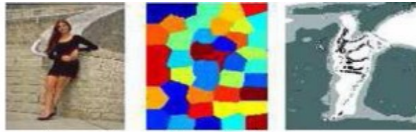
Fig.13. Perceptual Image Segmentation Algorithm

F) Image Segmentation (also known as image segmentation): Images are segmented for a number of purposes, the most essential of which is to split them into segments that are closely linked with the things or areas of the real world that are shown inside the photograph. During image processing, the significant pixels in a picture are separated from the rest of the image's pixels, which is known as segmentation. A picture segmentation algorithm provides a collection of segments that together cover the whole image, or a collection of contours that are recovered from the image.