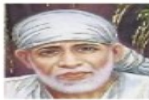
Figure 5: RGB Image Format

Image with three colours (RGB)- An RGB picture, often known as a true-color picture, is a kind of image that includes three colours. In MATLAB, these images are stored in the form of an m-by-n-by-3 data array, with the red, green, and blue components of each pixel specified by the red, green, and blue components of the data array that contains the image. The colour of each pixel is determined by the combination of the red, green, and blue intensities stored in each colour plane at the pixel's location, which are stored in each colour plane at the pixel's location, and which are stored in each colour plane at the pixel's location. Images in RGB format are saved as 24-bit images in graphics file formats, with each of the red, green, and blue components carrying eight bits of information. It is conceivable for an RGB array to belong to the double, uint8, or uint16 classes, depending on the kind of data it contains. 0 is assigned to each colour component of an RGB array of type double, while 0 is assigned to the whole array. Whenever the colour components of a pixel are (0,0,0), it is shown as black; otherwise, it is displayed as white (1,1,1). It is recorded in the third dimension of the data array, which runs along one of the third dimensions of the data array, that each pixel has three colour components stored in it.