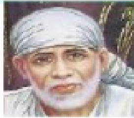
Fig.1. .JPG Image Format

Images of the following sorts are available: There are four distinct types of photos to choose from: High-intensity images - A high-intensity image is a data matrix whose values represent high-intensities that fall within a certain range of intensity. An intensity picture's elements belonging to the uint8 or uint16 classes have integer values in the ranges (0, 255) and [0, 65535], respectively, when the integer values are examined. As an additional benefit of being a member of the double-class, the values associated with the image may be expressed as floating-point numbers. Conforming to popular thinking, the range of pixels for intensity photographs with scaled, class double data types is from 0 to 1. For the purposes of MATLAB, an intensity picture is stored as a single matrix, with each element of the matrix representing one pixel of the related image.