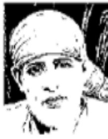
Fig.3. BW Image Format .This gives image in Black and White.

0s and 1s are represented as binary images in computer programming, and they are used to represent numbers in a logical array. Pixels with the value 0 are displayed with a black background, while pixels with the value 1 are presented with a white backdrop. Following the specifications of the MATLAB language, binary pictures must be classed as belonging to the logic class, which is why intensity images that contain just 0s and 1s are not classified as binary images[6].