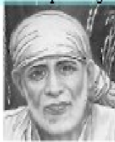
Fig.2. GRAY Image Format

Images of the following sorts are available: There are four distinct types of photos to choose from: High-intensity images - A high-intensity image is a data matrix whose values represent high-intensities that fall within a certain range of intensity. An intensity picture's elements belonging to the uint8 or uint16 classes have integer values in the ranges (0, 255) and [0, 65535], respectively, when the integer values are examined. As an additional benefit of being a member of the double-class, the values associated with the image may be expressed as floating-point numbers. Conforming to popular thinking, the range of pixels for intensity photographs with scaled, class double data types is from 0 to 1. For the purposes of MATLAB, an intensity picture is stored as a single matrix, with each element of the matrix representing one pixel of the related image.