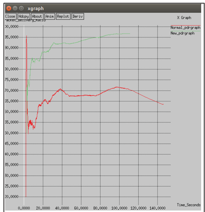
Fig. 2: Comparative PDR Graph for Normal and Proposed New

Graph Summary: As the PDR ratio is used to identify the performance of the approaches using the packet delivery ratio. It is the ratio of number of packet sent to the number of packet received. In ideal condition it should be high as possible. For comparing the suggested work, the above graph interprets the result as an improved PDR ratio than the existing approaches.