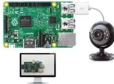
Fig:6 Raspberry pi with USB camera.

PIR sensor connection with Raspberry Pi is show in above Schematic diagram.