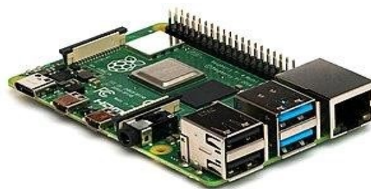
Fig: 2 raspberry pi

A Raspberry Pi series of small single-board computers developed in the United Kingdom by Raspberry Pi Foundation in association with Broadcom . A raspberry pi is a fully functional tiny computer in available in low-cost. It is also known as single board computer, but it is nothing less than a computer. It is basically used for teaching basic computer science in school level. The Raspberry Pi has it's uses in many areas like weather forecasting, Robotics and in several automations. It is available at a very low cost and it's adaptive nature is very helpful in designing many circuits