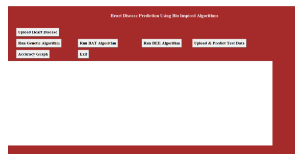
Fig.1. Home page.

The results obtained after executing the implementation code is shown from Fig.1 to Fig.9. To run this project double click on 'run.bat' file to get below screen