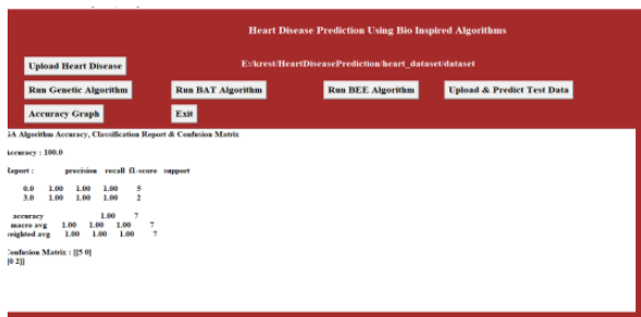
Fig.3. Genetic Algorithm Accuracy.

Now click on ‘Run Genetic Algorithm’ button to run genetic algorithm on dataset and to get its accuracy details. While running this algorithm u can see black console to see feature selection process, while running it will open empty windows, u just close all those empty windows except current window