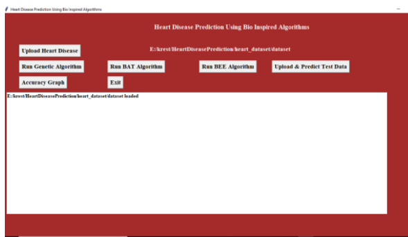
Fig.2. Run Genetic Algorithm.

Now click on ‘Run Genetic Algorithm’ button to run genetic algorithm on dataset and to get its accuracy details. While running this algorithm u can see black console to see feature selection process, while running it will open empty windows, u just close all those empty windows except current window