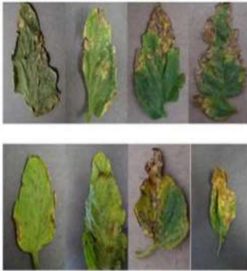
Fig 2.2: Unhealthy leaves