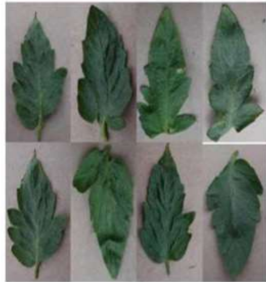
Fig.2.1: Healthy leaves

compared the image. It is possible that data can be repeatable (Ganesh Babu Et.al. 2020). So using some attribute like name of the leave or size of the image Data set can be erased (Parthia et.al. 2020). In the figure 2.1 sown some healthy leaves. And the other hand 2.2 figure shown diseases plant leave.