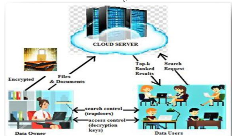
Figure 1 : System architecture of ciphertext data

With the development of various stages for sharing the data's by means of cloud server, cloudlets and so on, the keywords search is necessary to search the files from the cloud storage. To maintain the information safety the security level should be enhanced. The proposed system is designed using three modules namely. Data Owners, Data Users, Cloud Servers as illustrated in the figure 1.