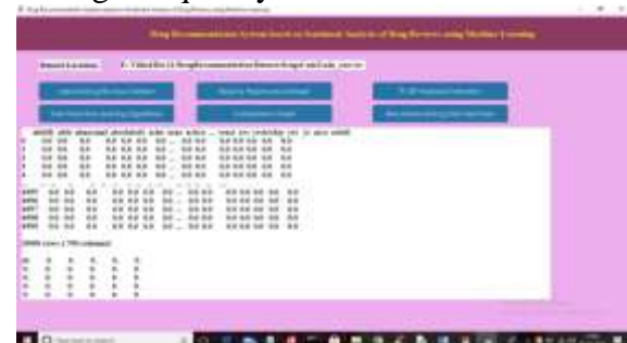
Fig.5. Word Average Frequency

In above screen to see from all reviews stop words and special symbols are removed and in graph I am displaying TOP 20 medicines exist in dataset. In above graph x-axis represents drug name and y-axis represents its count. Now close above graph and then click on 'TF-IDF Features Extraction' button to convert all reviews in to average frequency vector