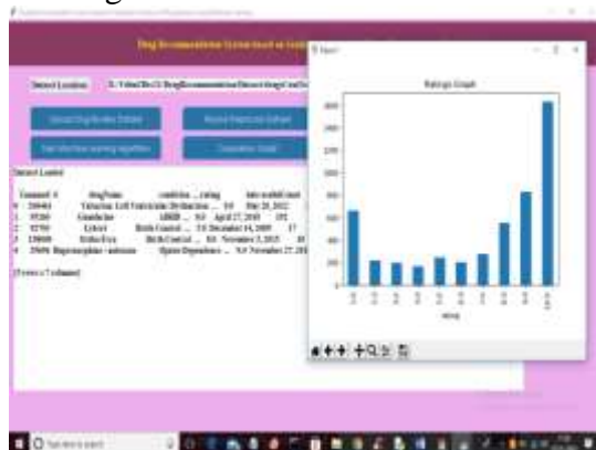
Fig.3. Ratings Graph

In above screen selecting and uploading DRUG dataset and then click on 'Open' button to load dataset and to get below screen