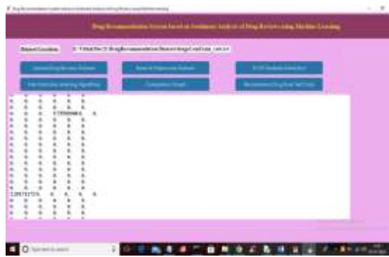
Fig.6. Word Average frequency(non-zero)

In above screen you can see some columns contains non-zero average frequency values and now TF-IDF vector is ready and now click on 'Train Machine Learning Algorithm' button to train all algorithm and get below output