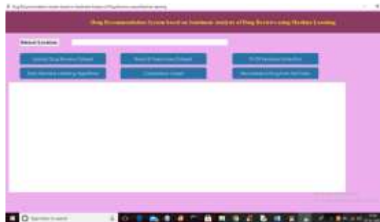
Fig.1. Home page

to verify the registration. User has to View All Files Download.