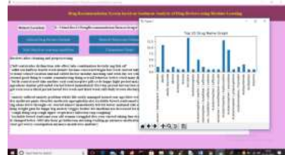
Fig.4. Top 20 Drug Name Graph

Dataset' button to read all dataset values and then preprocess to remove stop words and special symbols and then form a features array.