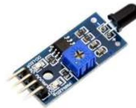
Fig : Flame Sensor

FLAME SENSOR: A flame detector is a sensor designed to detect and respond to the presence of a flame or fire. It also can detect ordinary light source in the range of a wavelength 760nm-1100 nm. The detection distance is up to 100 cm.