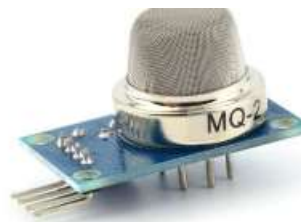
Fig: Gas Sensor

GAS SENSOR: MQ-2(HYDRO CARBON) This CO 2 Sensor can be used in a wide range of applications, including air quality monitoring, smoke alarms, mine and tunnel warning systems, greenhouses, etc. The sensor is easy to use and can be easily incorporated in a small portable unit.