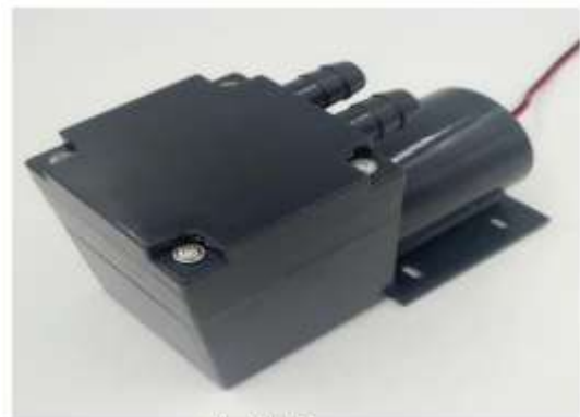
Fig -11: Pump

To pressurize the liquid a 12 V DC water pump can be used which has 2.5 L/min capacity can be used. Then the pressurized liquid enters the nozzle and gets sprayed. The nozzle that can be used is a flat fan type for spraying the liquid. Four nozzles are connected with ducts and they are placed at 45cm distance between each other.