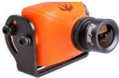
Fig -8: FPV camera

The camera that can be used is HD FPV camera 1200 TVL, it has 2.8mm Lens, auto/colour/ black & white Day and night format. TS5828 32CH mini transmitter can be connected to the camera for transmission of video signals to receiver at ground.