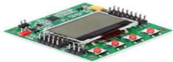
Fig -6: KK 2.1.5 Multi-Rotor LCD Flight controller

The flight controller helps in the manoeuvring operations and also it provides Auto level function. The accelerometer and gyroscope sensors in the Flight controller processes the signals from the receiver and gives the output to the ESC. The KK 2.1.5 Flight controller board can be used in the drone as it has inbuilt firmware. The features of this Flight controller board are much easier for calibration. It uses ATMEL Mega 644PA 8-bit AVR RISC-based microcontroller with 64K of memory