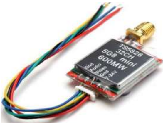
Fig -9: Video Transmitter