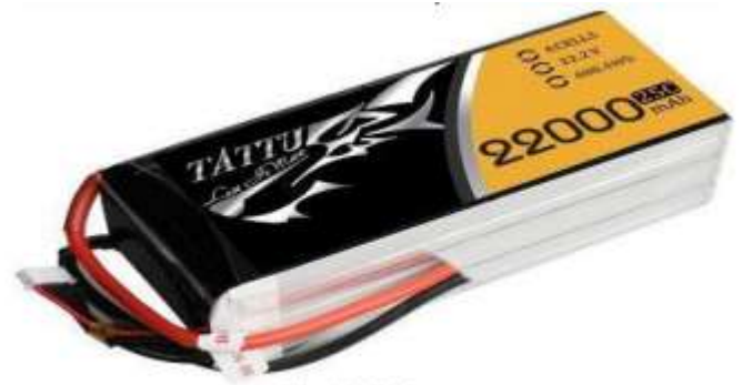
Fig -5: Li-Po battery

The battery that can be used is a Li-Po battery of 22000mAh capacity and 22.2 V. In this battery six Li-Po cells are connected in series ( 6 \times 3.7 = 22.2V ).