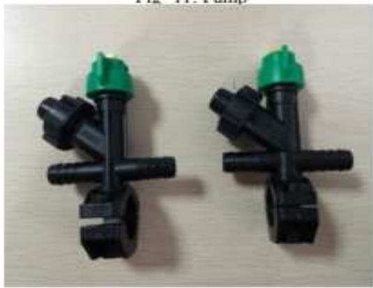
Fig -12: Flat fan Nozzle