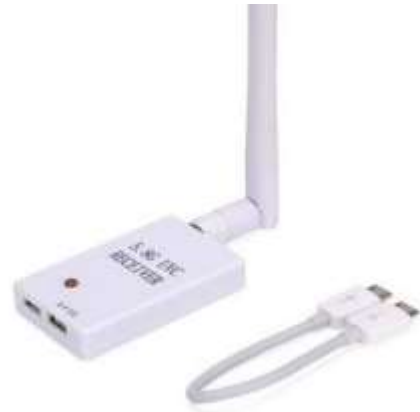
Fig -10: 5.8 UVC OTG Receiver