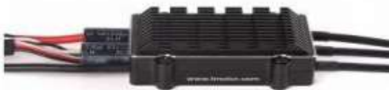
Fig -4: Flame 60A HV

It stands for Electronic Speed Controller and it is used to vary the Revolution Per Minute (RPM) of the motor. 60A rated ESC is used as per the motor and battery specifications.