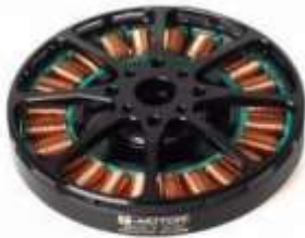
Fig -2: T-MOTOR MN 7005 KV115

Outer runner BLDC motors in which there are no brushes, they have a permanent magnet. The RPM of the motor can be controlled by varying the input current. This motor TMOTOR MN 7005 KV115 and P24x7.2F propeller produces a maximum thrust of 4783 grams