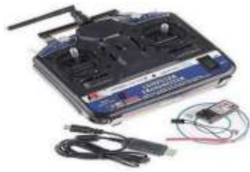
Fig -7: Fly sky CT6B 2.4 6CH Transmitter and FS-R6B Receiver